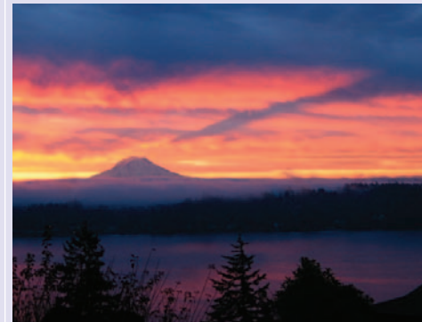
In addition to the magnificent sounds of the symposium, the sight of Washington's Gig Harbor at sunset is truly breath-taking.